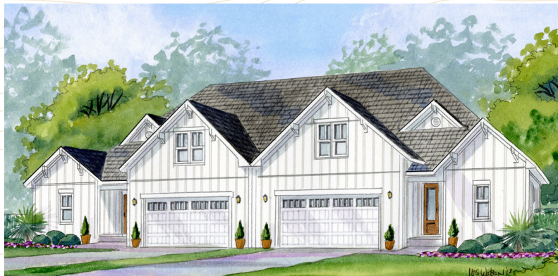
FARMHOUSE BONUS ROOM ELEVATION