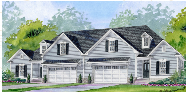
TRADITIONAL BONUS ROOM ELEVATION