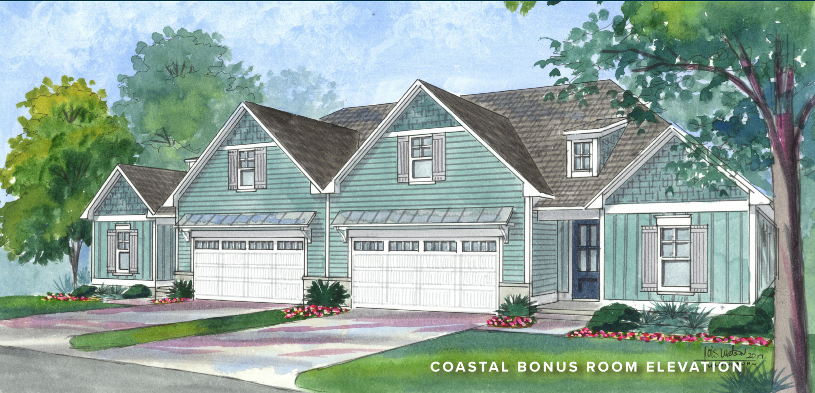
COASTAL BONUS ROOM ELEVATION